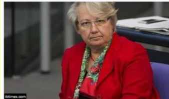
Menteri Pendidikan Jerman Annette Schavan mengundurkan diri.

http://www.republika.co.id/berita/internasional/global/13/02/09/mhyk2q-tersandung-dandal-plagiarisme-menteri-pendidikan-jerman-mundur